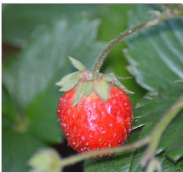
S t r a w b e r r y