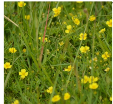
B u t t e r c u p