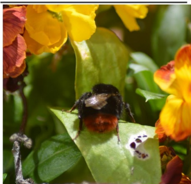
B u z z y B e e