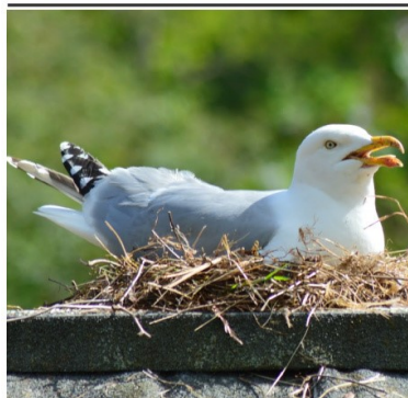
S e a g u l l