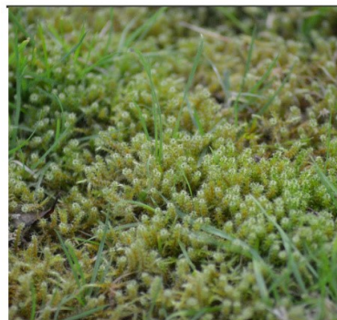
M o s s