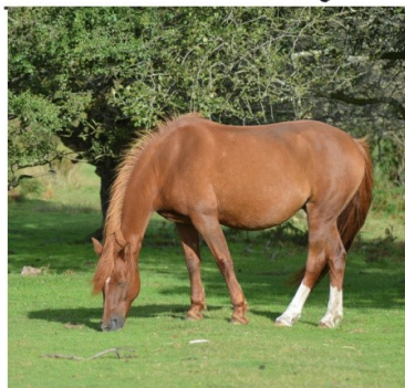
H o r s e o r P o n y